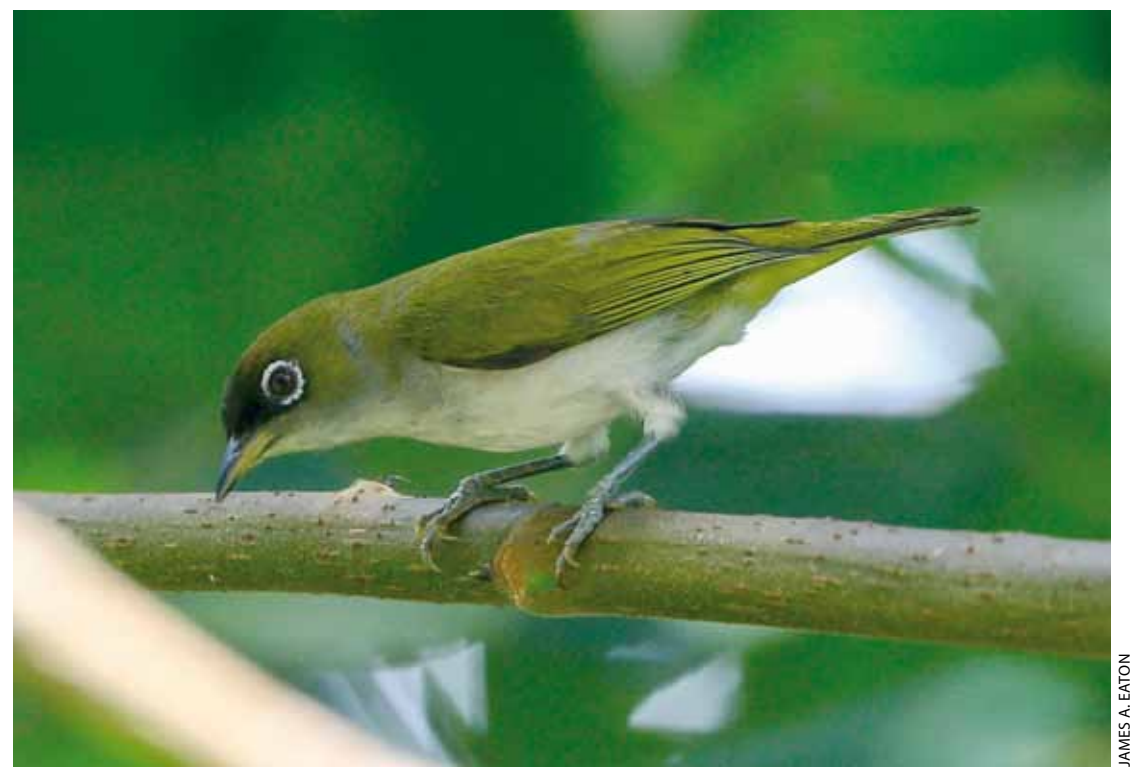
Plate 4. Obi White-eye Zosterops sp. nov., Obi, Northern Moluccas, 13 September 2016.

series of undulating, sweet musical notes lasting only 1–2 sec. However, individual Bacan songs always terminate in a rising flourish, whereas the Halmahera birds' songs have no fixed frequency pattern and never seem to include the final flourish.