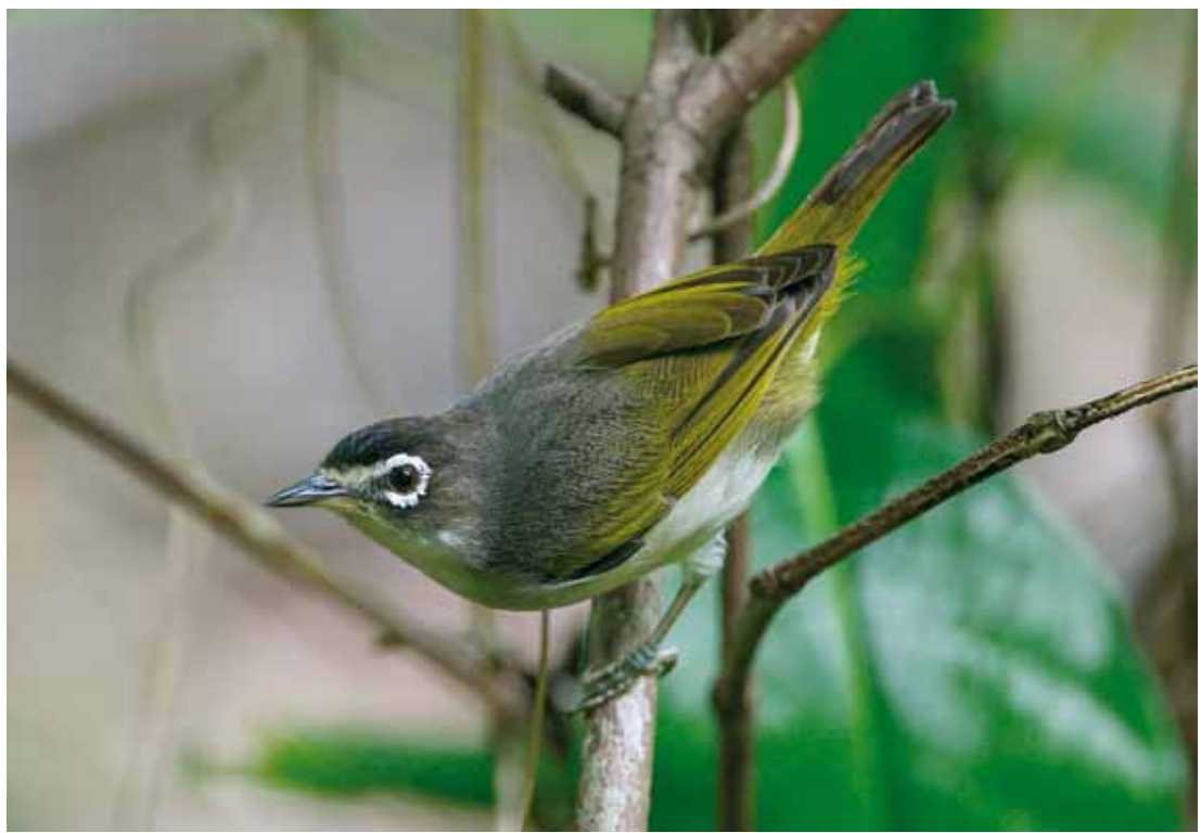
Plate 1. Morotai White-eye Zosterops dehaani, Morotai, Northern Moluccas, Indonesia, 15 September 2016.

most distinctive white-eyes of the Indonesian Archipelago.