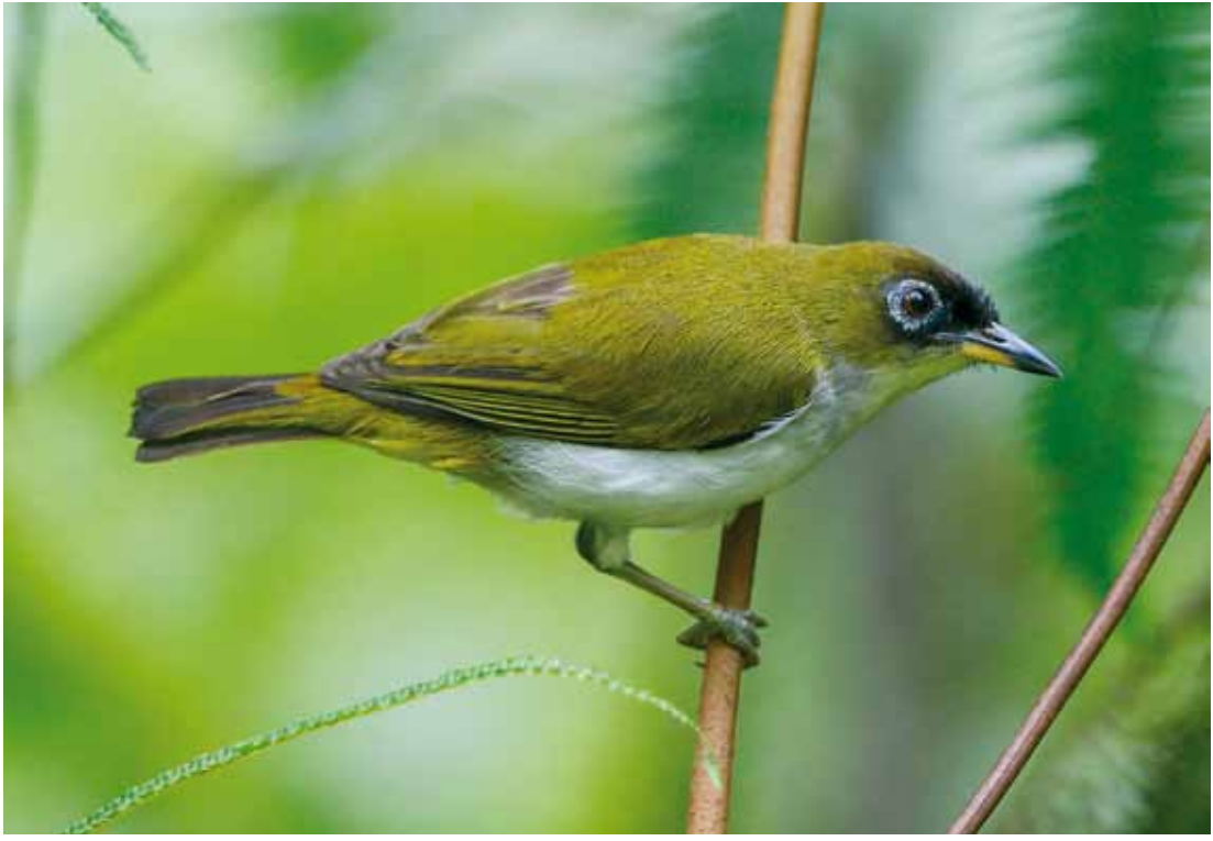
Plate 2. Halmahera White-eye Zosterops fuscifrons , Halmahera, Northern Moluccas, 6 December 2014. Plate 3. Bacan White-eye Zosterops atriceps , Bacan, Northern Moluccas, 10 September 2016.