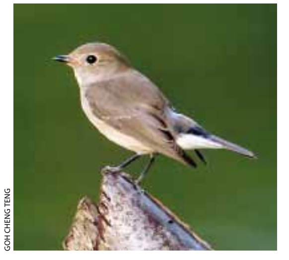
Plate 7. Red-throated Flycatcher Ficedula albicilla , Singapore Botanic Gardens, Singapore, 4 December 2019.

In Singapore the third record of † Chinese Blue Flycatcher Cyornis glaucicomans was at the Central Catchment Nature Reserve, 18