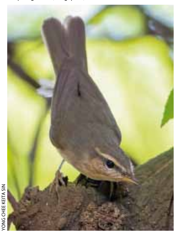
Plate 4 . Dusky Warbler Phylloscopus fuscatus , Khoo Teck Puat Hospital grounds, Singapore, 24 December 2019.

Warbler Acrocephalus tangorum is not listed as occurring in the Thai-Malay Peninsula (Wells 2010) but sightings are on the rise in Malaysia, with records across the Malaysian states of Perlis, Kedah, Penang and Perak throughout the season.