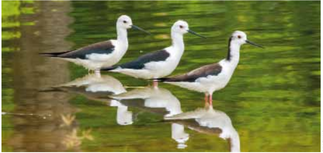
Plate 2. Line of three Black-winged Stilt Himantopus himantopus, Jurong Lake Gardens, Singapore, 16 February 2020.

In Malaysia notable records were: a †Eurasian Woodcock Scolopax rusticola at Ulu Kali, Selangor, 3 January–7 March (DB);