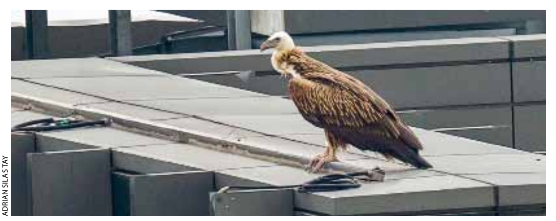
Plate 3. Himalayan Griffon Gyps himalayensis, one of a flock of 12, perched on top of Carlton City Hotel, Singapore, 9 January 2020.

one † Spotted Redshank Tringa erythropus at Semaloi, Johor, 2 February (VF) and at least three at Kuala Rompin, Pahang, 9–10 February (ATH); and a † Dunlin Calidris alpina at Teluk Air Tawar-Kuala Muda, Pinang, 9 March (DB).