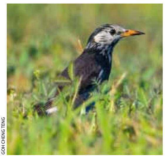
Plate 5 . White-cheeked Starling Spodiopsar cineraceus , Seletar, Singapore, 18 January 2020.

represented by races innotata and gibsonhilli (del Hoyo & Collar 2016). Records of the races characterised by a dark-barred face pattern, melli , courtoisi and aurimacula , appear to be rare. In Singapore, a bird at Dairy Farm Nature Park, 4 January–5 March (SS) and another at Hindhede Nature Park, 14 January–7 March (MK) both showed this feature (Plate 6). The first Singapore record of † Chinese Blackbird Turdus mandarinus was an extremely elusive bird at Jurong Lake Gardens, 11–16 February (OT).