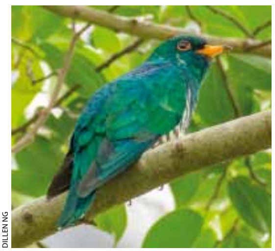
Plate 1 . Asian Emerald Cuckoo Chrysococcyx maculatus , Ghim Moh, Singapore, 23 March 2020.