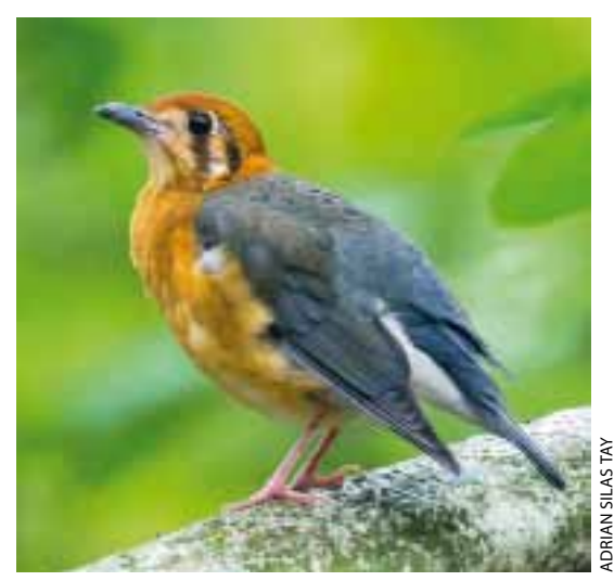
Plate 6. Orange-headed Thrush Geokichla citrina showing dark-barred face pattern, Dairy Farm Nature Park, Singapore, 18 January 2020.

February–12 March (Anon.). The first record of Blue Whistling Thrush Myophonus caeruleus was an individual of race caeruleus at Fort Canning Park, 3–24 December (NSSBG 2020c). The provenance of this bird is in doubt because the tip of the upper mandible was chipped, the central and outer tail feathers were moulting and tertials were damaged, but this record is included here for future reference. The first record of † Red-throated Flycatcher Ficedula albicilla was an individual at Singapore Botanic Gardens (Plate 7), 30 November–14 March (NSSBG 2020c) and a second was at West Coast Park, 22 February–2 April (YCKS). The third record of † Daurian Redstart Phoenicurus auroreus was a male at Singapore Botanic Gardens (Plate 8), 12–28 November (NSSBG 2019c), the fourth was at a condominium in Tanjong Rhu, 14–23 January (MG) and the fifth at the National University of